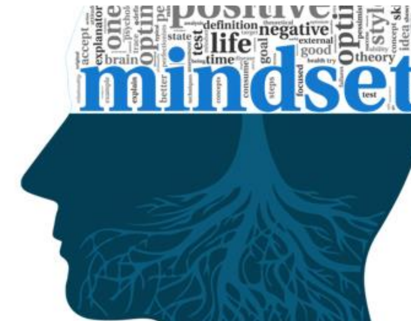
The Entrepreneurial Mindset