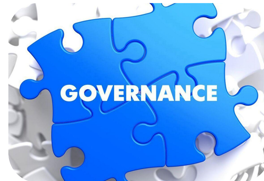
Corporate Governance & Leadership