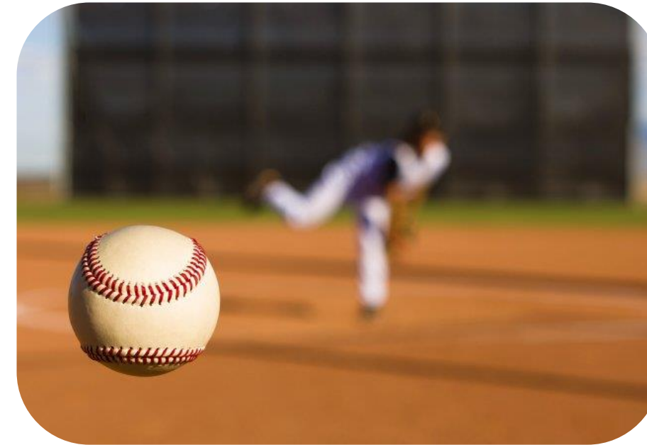
Pitch Deck Preparation & Delivering the Ultimate Elevator Pitch