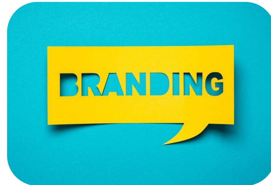
Marketing and Branding