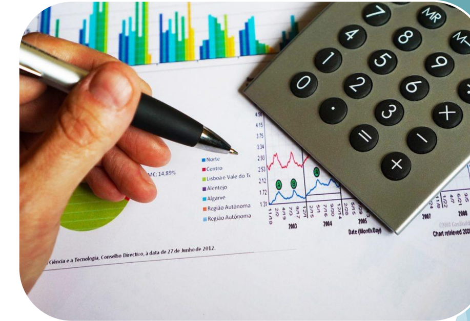
Financial Literacy & Management